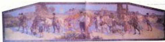
THE PAGEANT OF PROSPERITY Installed in 1918 (Library-Study, West Wall)

The title of the picture was suggested by Israel Zangwill's great drama, "The Melting Pot," and the theme of the artist is that majestic Scriptural quotation, from Acts 17:26: "And God Hath Made Of One Blood All Nations Of Men To Dwell On The Face Of The Earth."