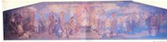
THE MELTING POT Installed in 1920 (Library-Study, East Wall)

As is suggested by the title, this painting represents in allegorical form the process of the Americanization of the foreign elements that come to America through immigration. As the central motif of the picture is America, symbolized by an heroic female figure, seated upon a throne, before whom passes the procession of immigrants, representing the brawn and brain from the old world that have made this country rich and great. As the procession of immigrants passes before the melting pot, they are seemingly transformed into a line of sturdy American workmen, mechanics, artisans, and farmers representing the ideal types that result from the fusing together of all the heterogeneous elements that flow through our ports of foreign entry.